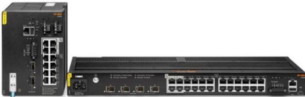
HPE Aruba Networking 4100i Rugged Switches

As part of HPE Aruba Networking's Edge Services Platform (ESP), HPE Aruba Networking CX switches play a foundational role in the Unified Infrastructure. Automation, embedded analytics, high availability, and secure segmentation are designed into CX switches with HPE Aruba Networking Central 1 delivering a unified, single view of the network that maximizes operational efficiency across enterprise networks. Dynamic segmentation extends HPE Aruba Networking's foundational wireless role-based policy capability to HPE Aruba Networking wired switches. What this means is that the same security, user experience and simplified IT management can be enjoyed throughout the network. Regardless of how users and IoT devices connect, consistent policies are enforced across wired and wireless networks, keeping traffic secure and separate.